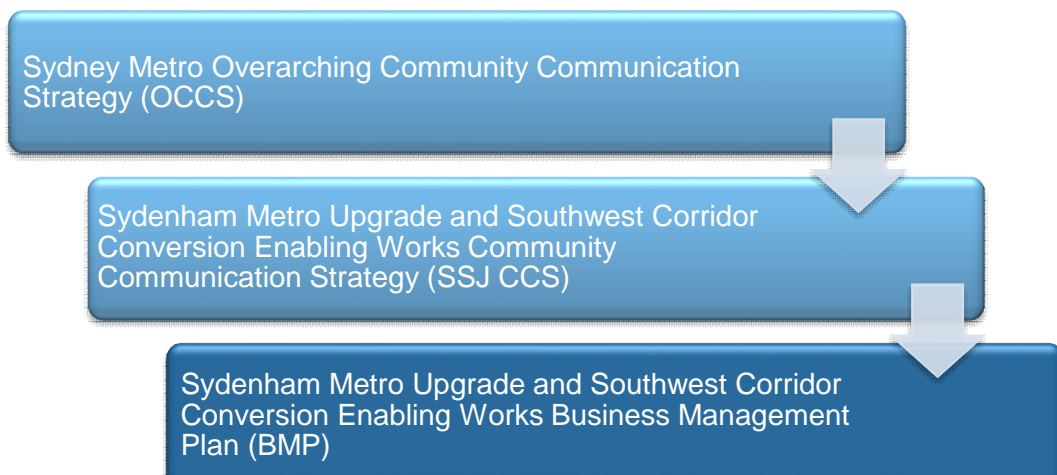
Figure 1: Management Plan Structure

The BMP has been prepared in line with the Sydney Metro OCCS and its relationship to the Sydney Metro engagement framework is outlined below: