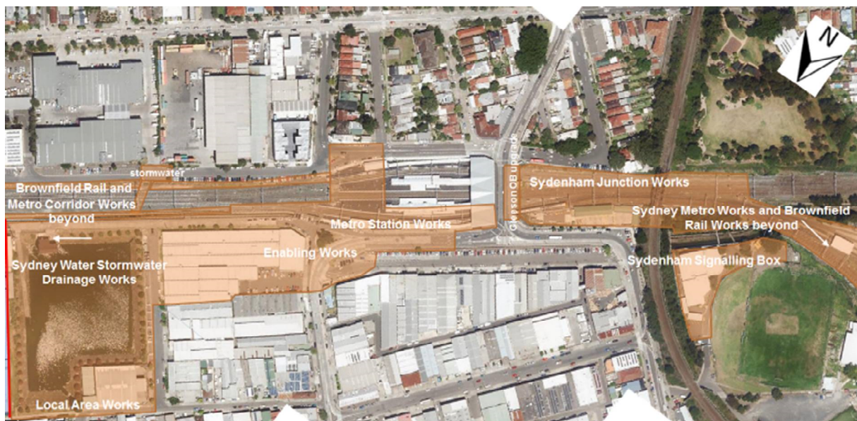
Figure 3: Sydenham Metro upgrade scope of work