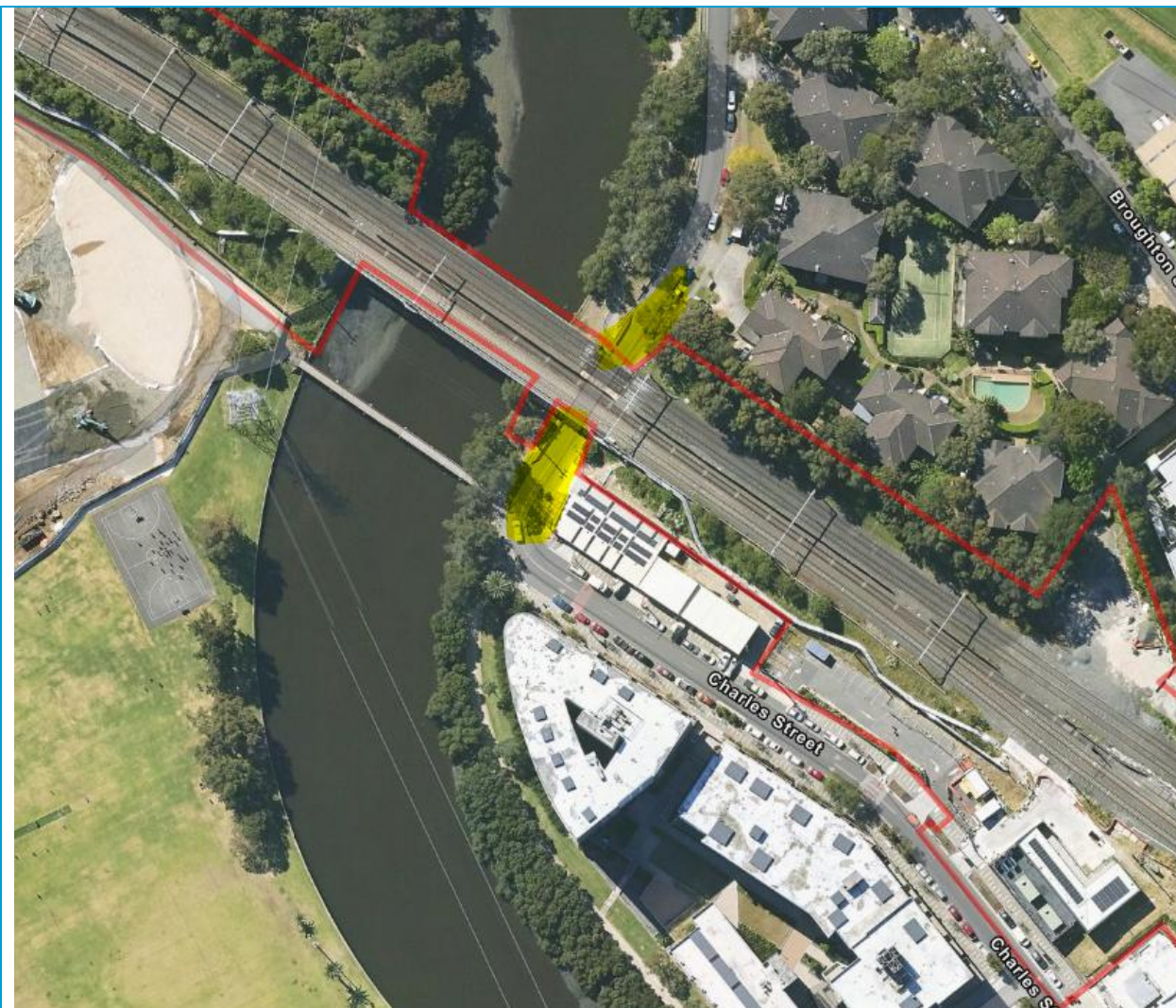
Figure 2 – Indicative location of temporary road closure at Cooks River/ Charles Street underbridge, Canterbury. Road closure highlighted in yellow.